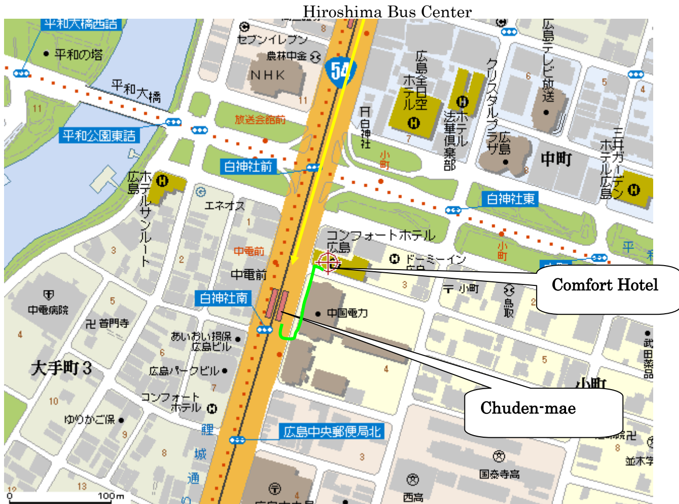
Map ④ How to get to the Hotel (from Chuden-mae)