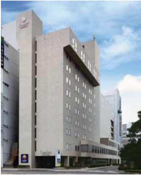
←Comfort Hotel, Hiroshima